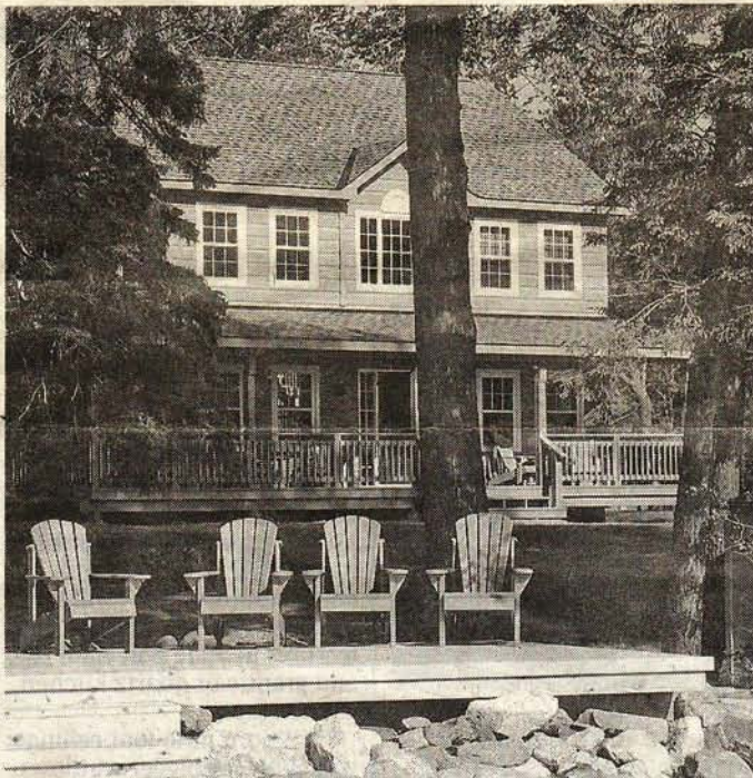
With cottages in use year-round, some observers worry about the impact on lake and water resources. CHANDLER POINT CORP.

s offer a he Lodge rench metres six- Canadian rockville,