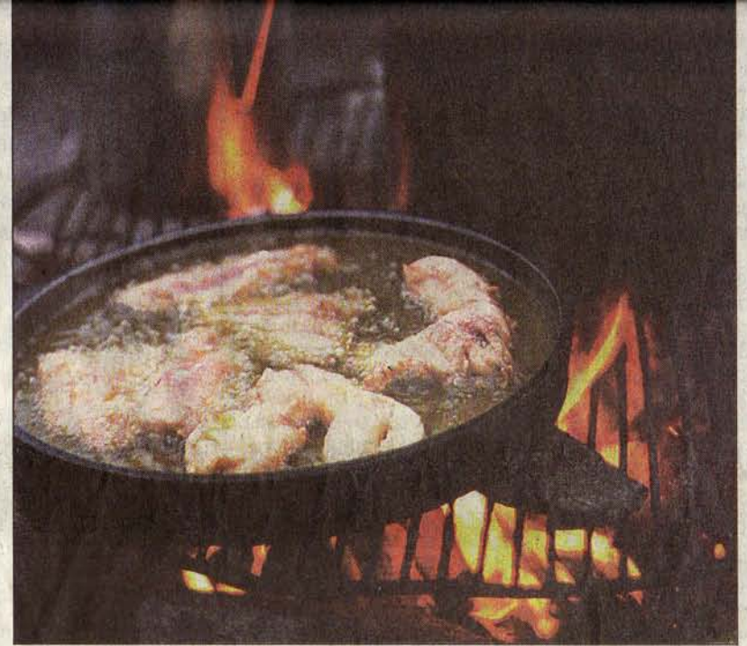
Freshly caught walleye sizzles in the frying pan, while a pot of coffee and a pot with sucker head soup (Dokis First Nations traditional specialty) simmers to perfection on the open fire.

Modern-day Voyageurs are drawn to the scenic beauty of the French River, much like the great explorers of old.